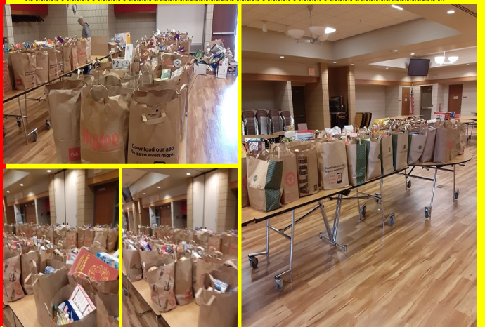
Council Facilitated Activities from p. 2